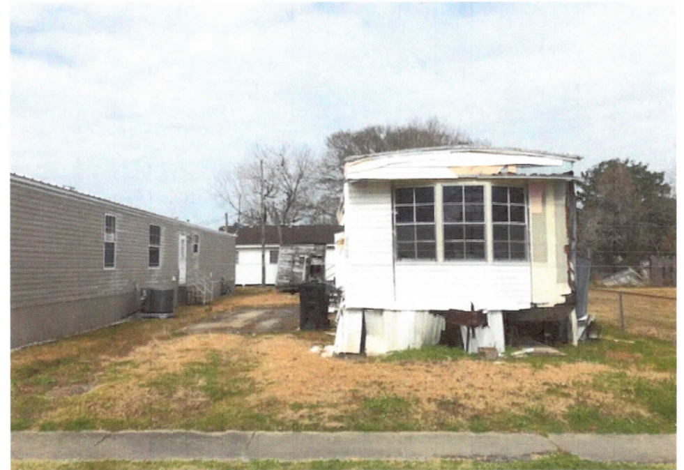
1807 Prairie Avenue