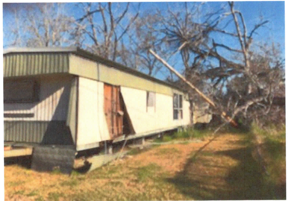
1009 Vernon St.